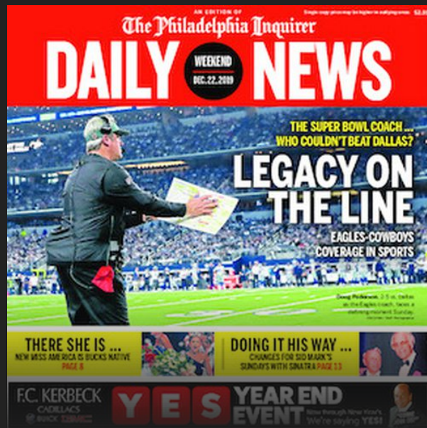
THE DAILY NEWS